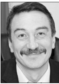
Vasily Kusin Minister of culture of the Novosibirsk region