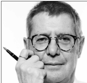
Wolf D. Prix / Austria architect Coop Himmelblau