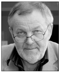
Vladimir Fefelov Main architect of the Novosibirsk City